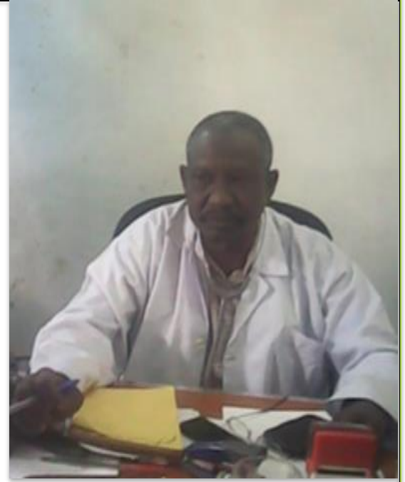
The lab Technician