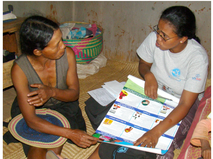
A community health worker explains the various methods of family planning to an interested woman.

The SHOPS project conducted a randomized controlled trial that included 622 CHWs in three regions of Madagascar. CHWs were randomly assigned, at the individual level, to a group that was offered pregnancy test kits and training on their use (treatment group) and a control group that received neither the kits nor training. The study team conducted a baseline survey of CHWs to gather information on their background and client load. The team also collected data on family planning services provided by the CHWs during the four months following the training. The researchers compared the number of new hormonal contraceptive clients who purchased their contraceptives from CHWs in the treatment group compared to the number in the control group. The difference in new clients between the two groups represents the effect of the intervention. The study used multivariate regression analysis to adjust for background characteristics that differed between the treatment and the control group CHWs.