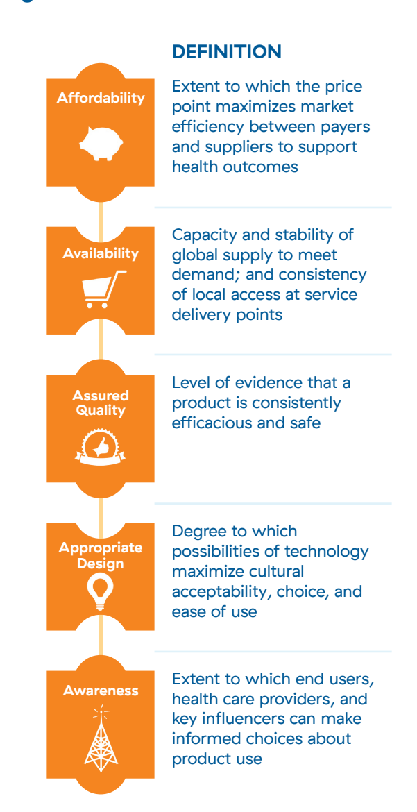
Figure 2. The five A's of market health